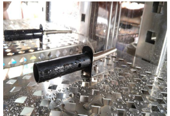
Black panel temperature sensor